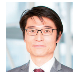
Center Director, Quantum information physics laboratory Director

Outstanding researchers in quantum information both in and outside Yokohama International University are gathered in the Center. The Center fosters an environment in which these researchers can routinely exchange information and create ideas, continuously launching joint research with high research value in a timely manner. The Center accepts national projects and participates as a nexus for international joint projects, earning the trust of outside parties as a suitable organization for tackling global top-level, large-scale research projects. As such, it was launched as a global research hub for advancing practical research in this field.