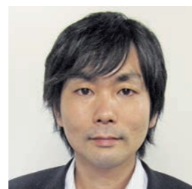
Advanced energy storage research laboratory Director