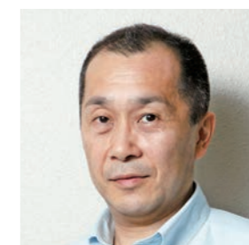
Quantum-controlled- electron integrated- circuit laboratory Director