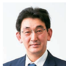
Center Director, Green hydrogen research laboratory Director