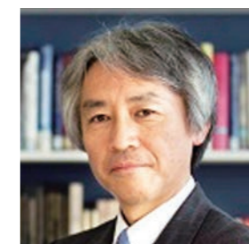
Integrated photonics laboratory Director