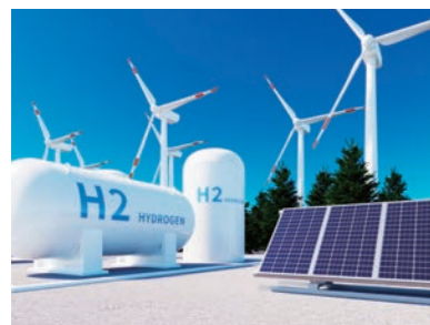
Green Hydrogen Research Laboratory

The Advanced Chemical Energy Research Center is established within the Institute of Advanced Sciences. The Center incorporates two laboratories, a green hydrogen research laboratory and an advanced energy storage research laboratory. The Center liaises with researchers inside and outside the Institute of Advanced Sciences to pursue research activities.