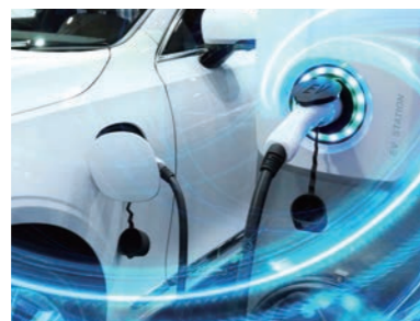
Advanced Energy-Storage Research Laboratory