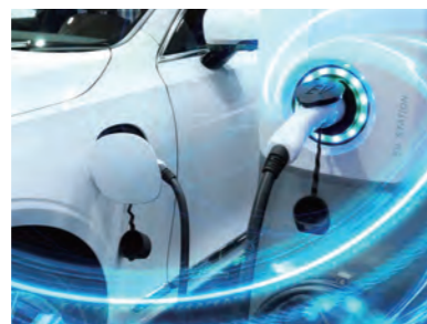
Advanced Energy-Storage Research Laboratory