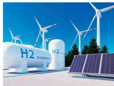
Green Hydrogen Research Laboratory

The Advanced Chemical Energy Research Center is established within the Institute of Advanced Sciences. The Center incorporates two laboratories, a green hydrogen research laboratory and an advanced energy storage research laboratory. The Center liaises with researchers inside and outside the Institute of Advanced Sciences to pursue research activities.